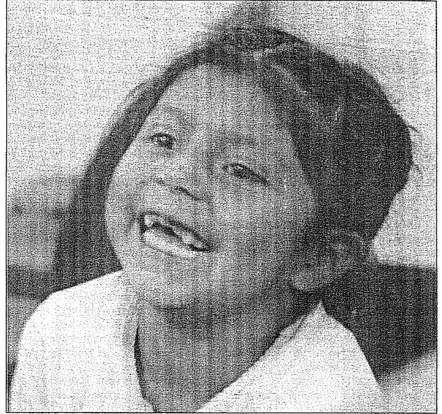
Guatemalan girl with a big smile.