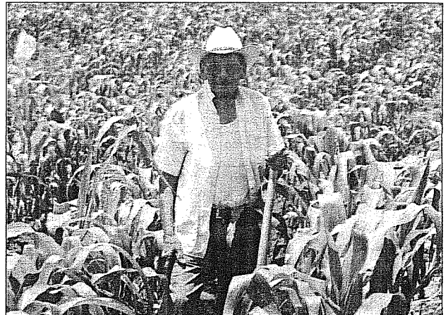
A local farmer.