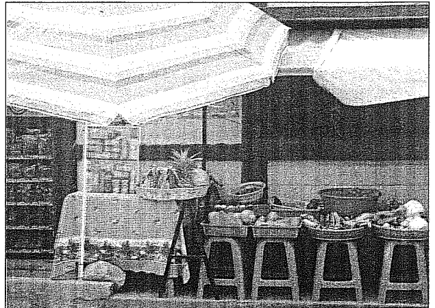
The many colors of the marketplace.